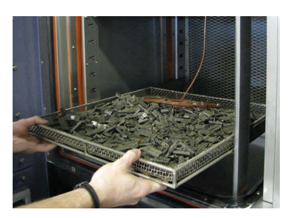
Product thermocouple can be added to monitor the samples during the test cycle.