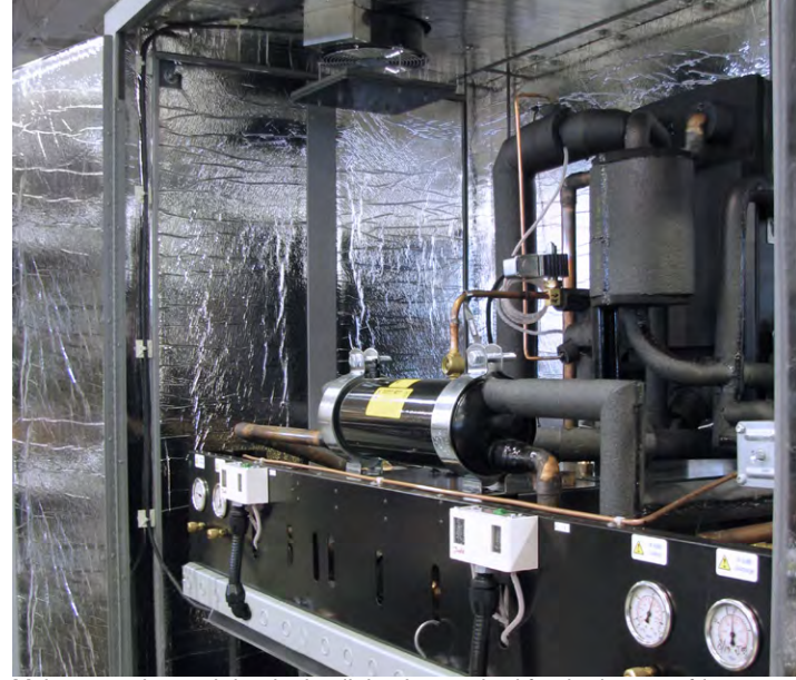
Mylar-coated sound deadening lining is standard for the larger refrigeration systems to limit noise to the room.