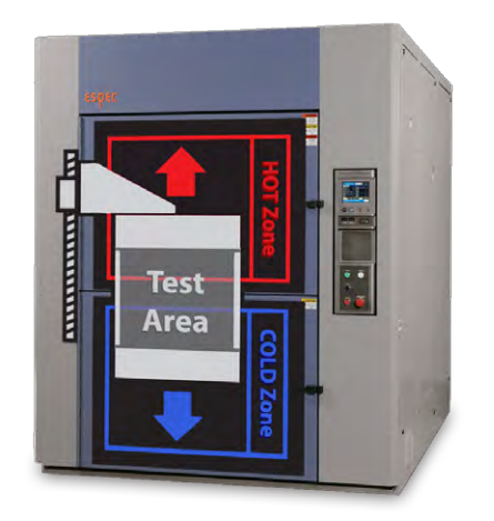
Transfer between zones takes less than ten seconds, as required by Mil-Std methods.

An electric screw drive transfers the test area between hot and cold zones. Carrier arms extend through slots in the side wall of the hot zone, supporting the basket carrier.