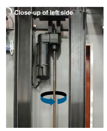
For strength, the lift system uses a heavy-duty screw drive motor and is braced by an angle-iron frame.